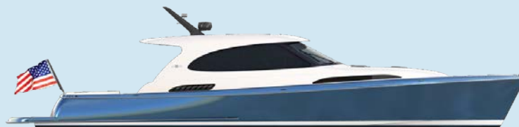
GT50 EXPRESS WITH LOWER GALLEY

The GT50 is available in two versions – open top or express. Both of these are designed to feature a lower galley.