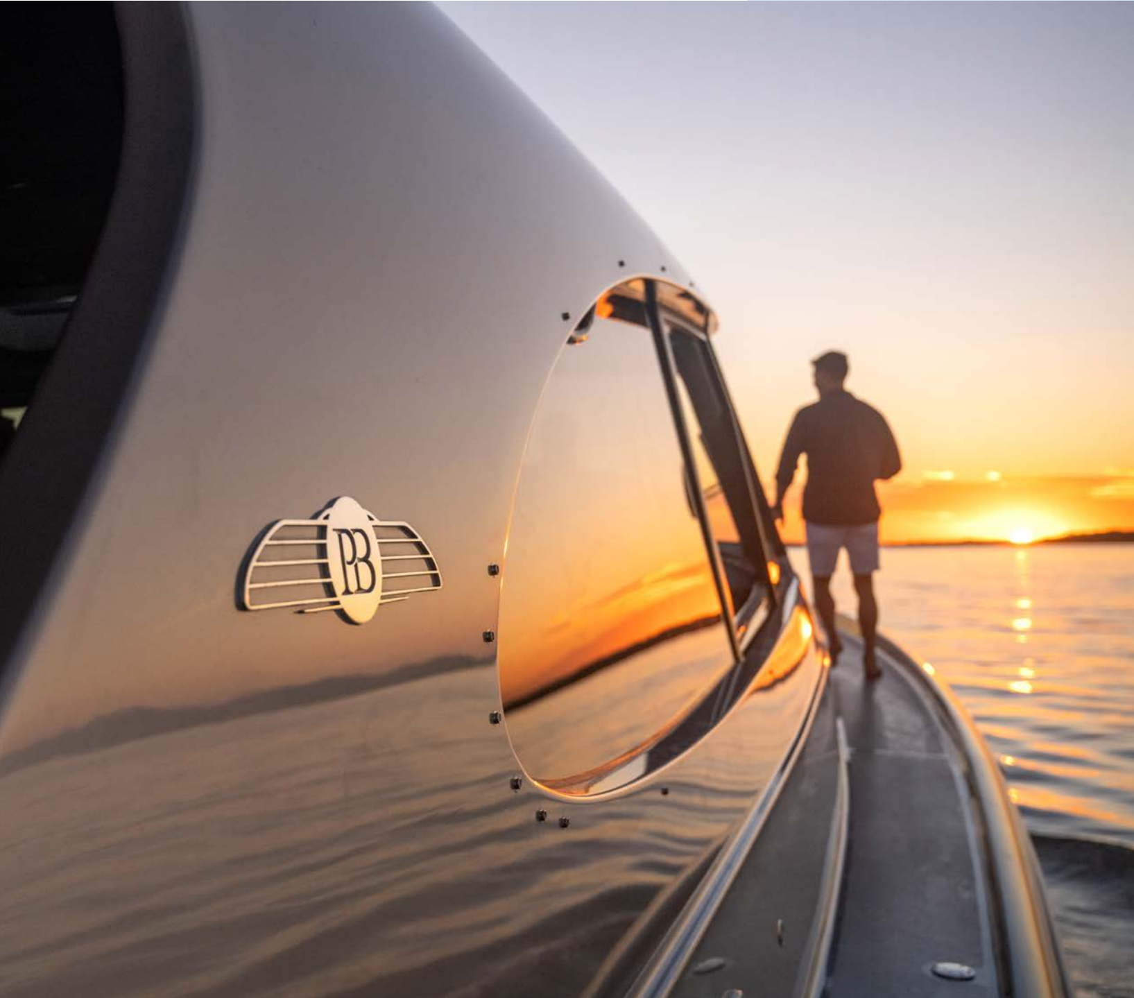
PALM BEACH GT SERIES GT50 / GT60